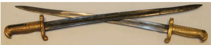
***Are these for the same rifle or not?