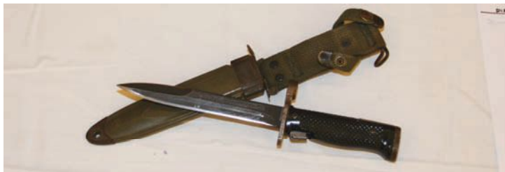
Prototype Imperial bayonet from the early '60s.