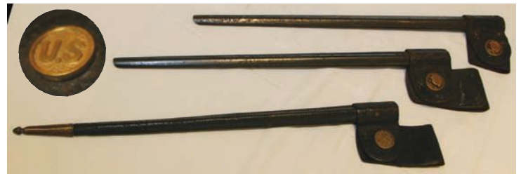
*Emerson & Silver metal scabbard altered post-CW with Hoffman swivel Ca. 1871 scabbard altered at Watervliet Arsenal with Hoffman swivel Early post-CW Hoffman swivel with U.S rosette for .58 rimfire and .50-70 rifles