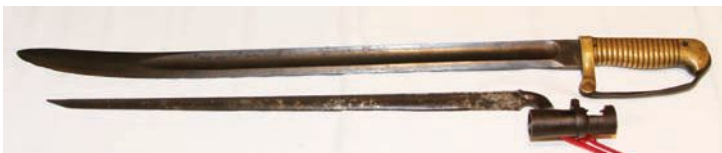
Modified M1855 Sword Bayonet "Chavassi" marked Enfield socket