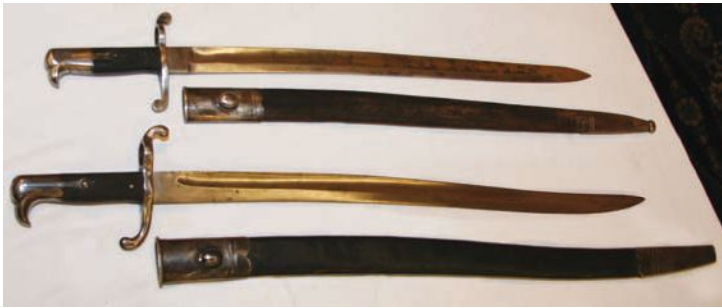
Town guard of Prague and an unknown.