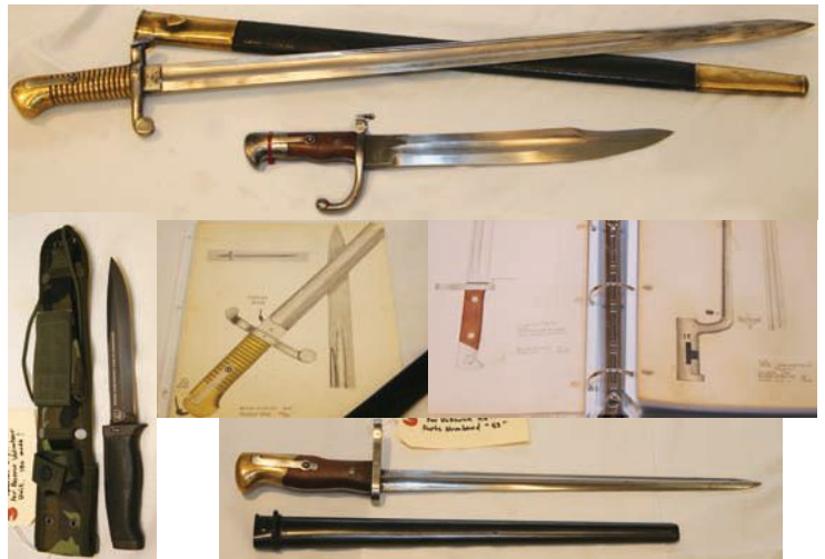
Four bayonets and the Terry Brown bayonet drawings