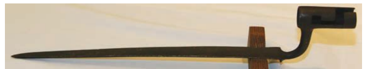
Early Germanic carbine bayonet with 4-step slotting. Does anyone has a positive ID?